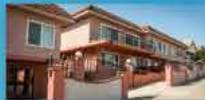
COMMERCIAL, SOUTH SAN FRANCISCO (HHDC) 15 Units • 33 Residents