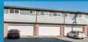
CHERRY, SAN CARLOS (HHDC) 6 Units • 12 residents