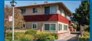
IDAHO, SAN MATEO (HHDC) 6 Units • 8 residents