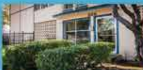
200 SOUTH DELAWARE, SAN MATEO (HHDC) 17 Units • 31 Residents