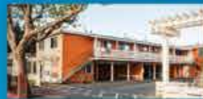
WILLOW ROAD (HHDC) 12 Units • 27 Residents