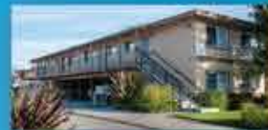
REDWOOD OAKS, REDWOOD CITY (LLP) 36 Units • 49 Residents