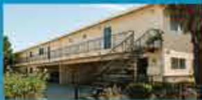
EL DORADO, SAN MATEO (HHDC) 5 Units • 29 residents