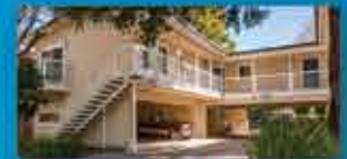
11 SOUTH DELAWARE, SAN MATEO (HHDC) 17 Units • 21 Residents