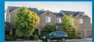
PINE, REDWOOD CITY (HIP) 3 units • 18 Residents