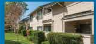
EDGEWATER ISLE, SAN MATEO (EWI) 93 Units of Senior Housing 105 residents