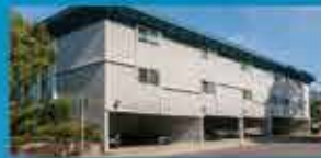
HILLSIDE, DALY CITY (HHDC) 19 units • 33 residents