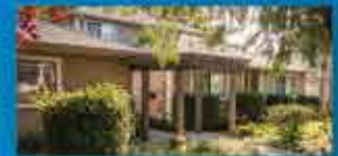
CEDAR, SAN CARLOS (HIP) 3 Units • 16 Residents