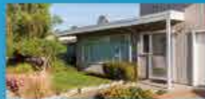
OXFORD, REDWOOD CITY (HHDC) 3 units • 4 residents