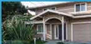
HILTON, REDWOOD CITY (HIP) 3 Units • 18 Residents