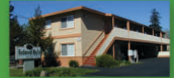
REDWOOD OAKS, REDWOOD CITY (LLP) 36 Units • 52 Residents