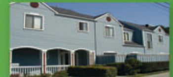
PINE, REDWOOD CITY (HIP) 3 units • 18 Residents