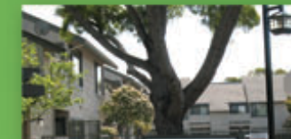
EDGEWATER ISLE, SAN MATEO (EWI) 92 Units of Senior Housing 107 residents