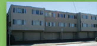
200 SOUTH DELAWARE, SAN MATEO (HHDC) 17 Units • 34 Residents