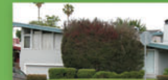
OXFORD, REDWOOD CITY (HHDC) 3 units • 5 residents