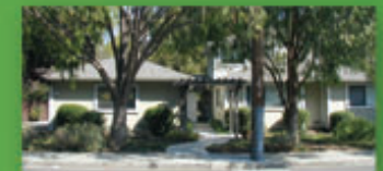
CEDAR, SAN CARLOS (HIP) 3 Units • 14 Residents