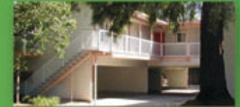
11 SOUTH DELAWARE, SAN MATEO (HHDC) 11 Units • 19 Residents