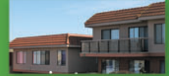
COMMERCIAL, SOUTH SAN FRANCISCO (HHDC) 15 Units • 34 Residents