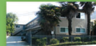
EL DORADO, SAN MATEO (HHDC) 6 Units • 20 residents