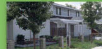
HILTON, REDWOOD CITY (HIP) 3 Units • 14 Residents