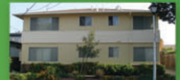
IDAHO, SAN MATEO (HHDC) 6 Units • 10 residents