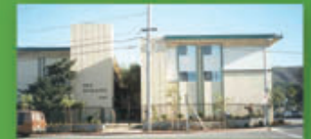
HILLSIDE, DALY CITY (HHDC) 18 units • 33 residents