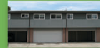
CHERRY, SAN CARLOS (HHDC) 6 Units • 9 residents