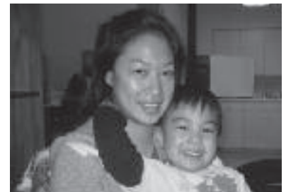
Parents who are committed to reaching their educational/job training goals to provide for their families.