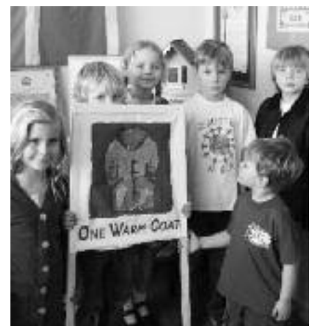
Elementary students from South Hillsborough conducted their annual One Warm Coat drive to benefit Self-Sufficiency families.

Through Property Development, HIP Housing expands the pool of affordable housing for low-income persons and families in San Mateo County by developing new and acquiring and rehabilitating existing housing.