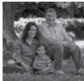
Thanks to Doerr Studios in Burlingame, Self-Sufficiency Graduate families received a free portrait session to have a special family photo.

We value all our supporters. We apologize in advance for any omissions. Please inform us if your gift has not been listed.